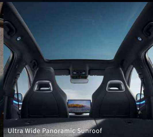
Ultra Wide Panoramic Sunroof