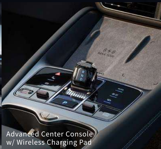
Advanced Center Console w/ Wireless Charging Pad