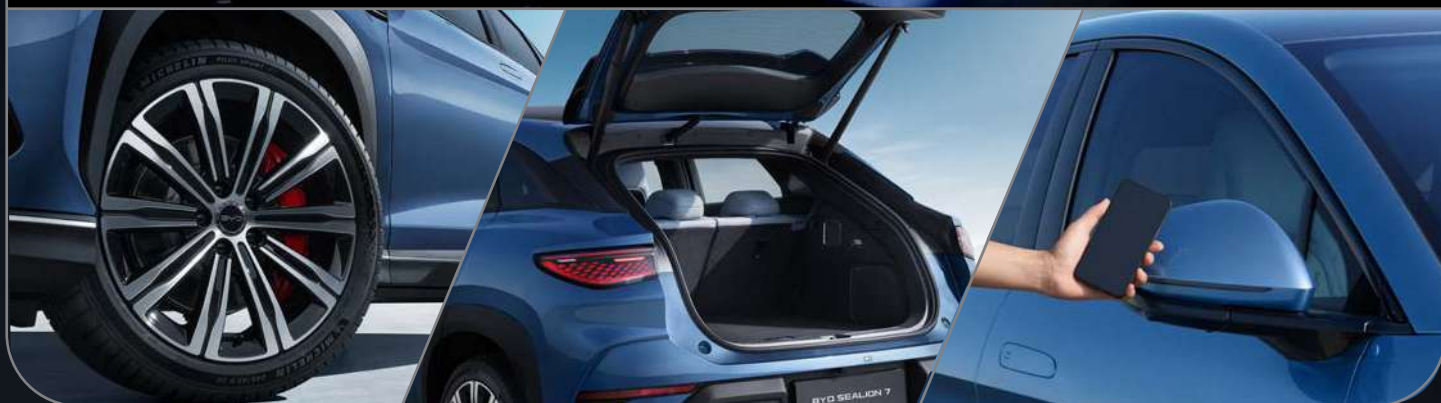
19-Inch Alloy Wheels