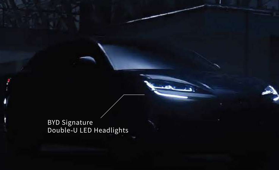
BYD Signature Double-U LED Headlights