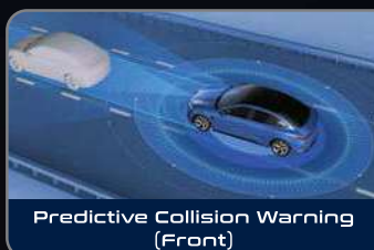
Predictive Collision Warning (Front)