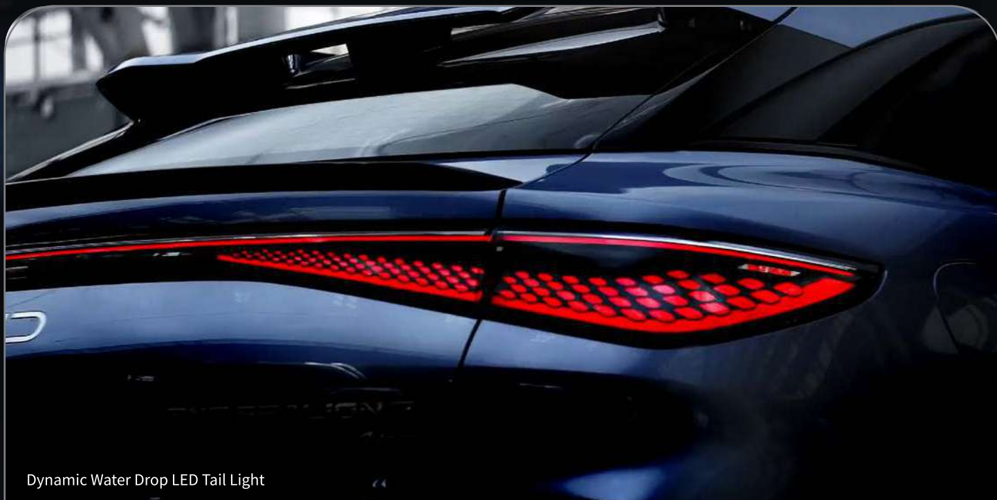
Dynamic Water Drop LED Tail Light