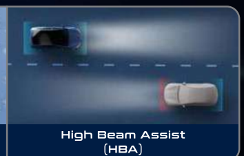
High Beam Assist (HBA)

BYD ADAS (Advanced Driver Assistance Systems) is a sophisticated suite of safety technologies utilizing advanced sensors and intelligent algorithms to enhance driver awareness and mitigate risks on the road.