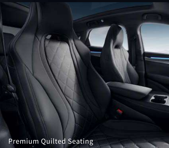
Premium Quilted Seating

BYD SEALION 7 embodies a bold vision of electric mobility with its sleek lines and commanding stance. Every detail, from the fluid design to the thoughtfully spacious interior, is designed to elevate the driving experience. Merging cutting-edge technology with a refined sense of style, the BYD SEALION 7 delivers not just performance, but an unmatched journey that redefines what an electric SUV can be.