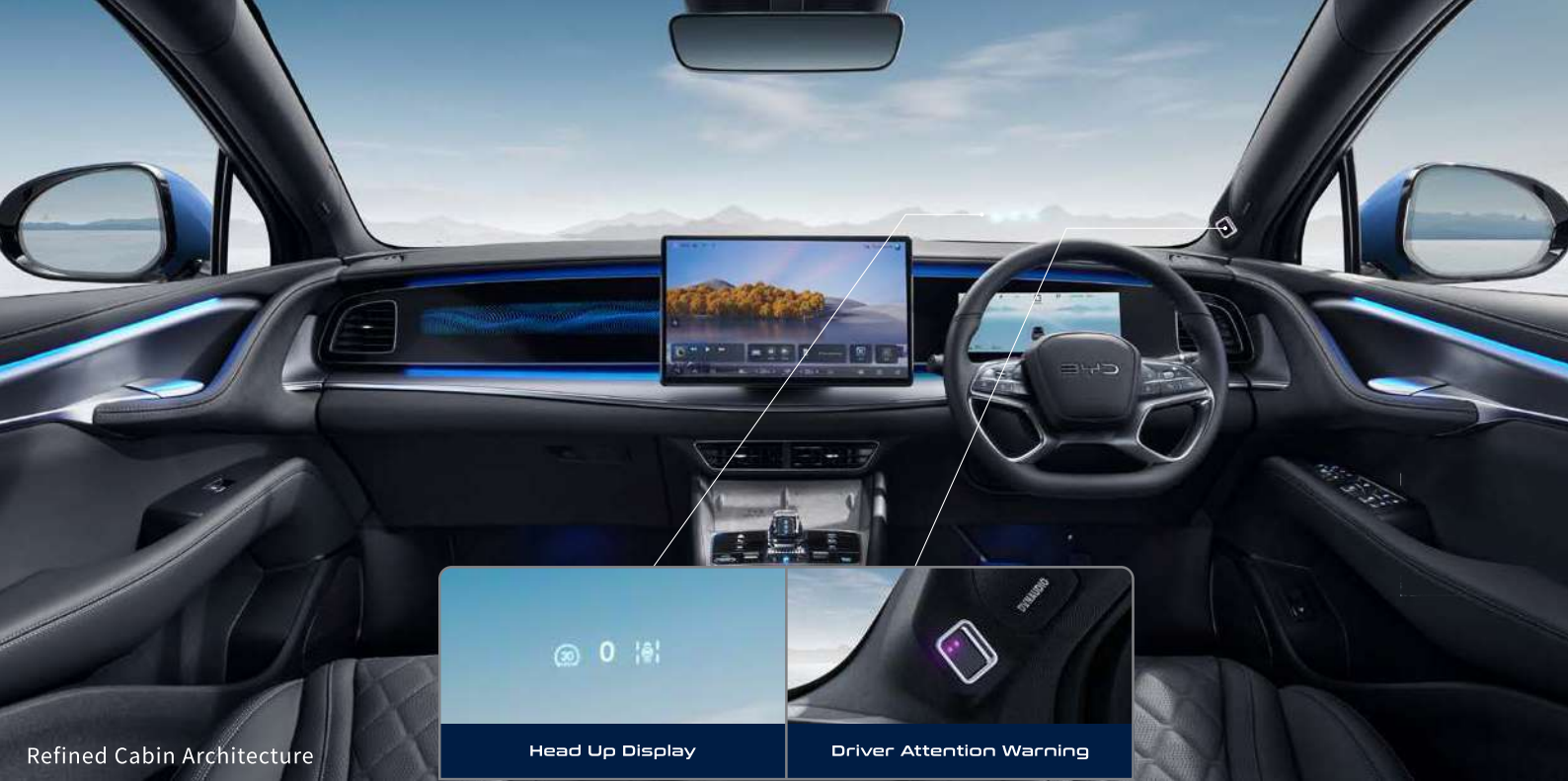
Refined Cabin Architecture