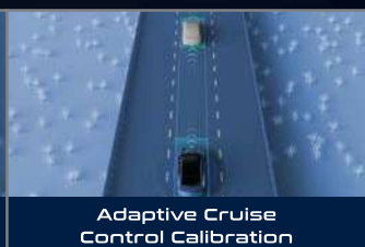
Adaptive Cruise Control Calibration