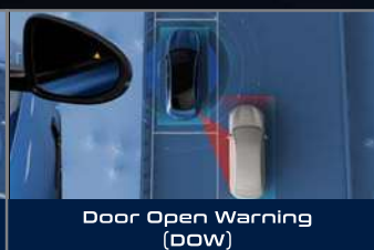
Door Open Warning (DOW)